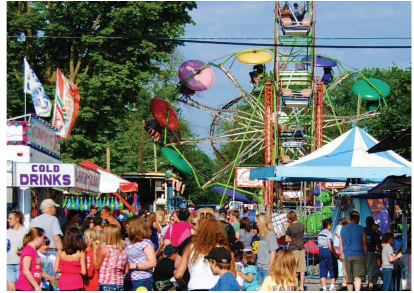
The 2017 East Jordan Freedom Festival is underway in the community of East Jordan. The six-day annual event will run through July 2, and features activities and entertainment for the entire family and for all ages.

6 PM - Open Play Horseshoes, Outdoor Seating and service & Open Bowling at The Zone Sports Lounge