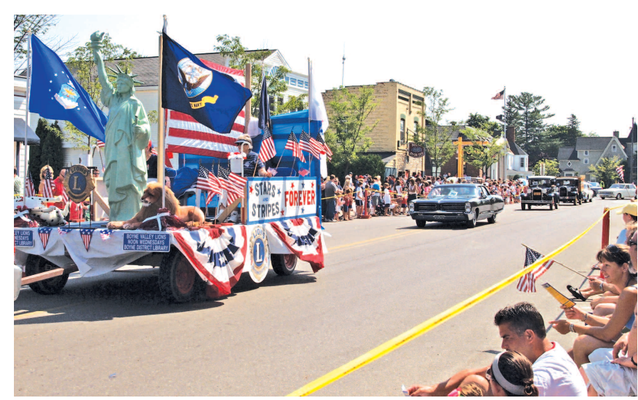
An action-packed Boyne City 4th of July Festival fun begins on Monday, July 3, and the Grand Parade and other activities will take place on Tuesday, July 4th.

on Tuesday. In case rain, the fireworks will take place on Wednesday evening.